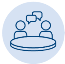
Engagement and communications