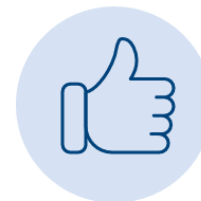
Empowerment and recognition