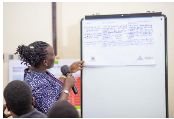
A participant presenting at the National Data Review Meeting in Uganda, February 9, 2024.