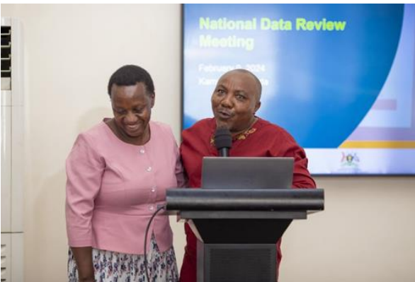
Speakers at the National Data Review Meeting in Uganda, February 9, 2024.