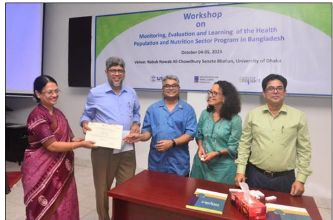
MEL workshop participants received certificates upon completion.