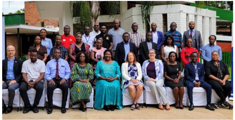
Malawi SEED midline evaluation dissemination meeting with USAID, Ministry of Education, and local actors.

• In Malawi , D4I facilitated two dissemination events for the Malawi Secondary Education Expansion for Development midline evaluation with USAID/Malawi, the Ministry of Education, and other local actors in February 2024. Urban midline qualitative findings were summarized in a December 2023 brief .