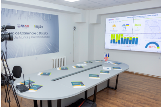
The Ministry of Labor and Social Protection's Data Review Room in Chişinău, Moldova.

future emergencies. The first Room was launched in Ştefan Vodă, a central entry point for many fleeing Ukraine, within the Directorate General for Social Assistance and Family Protection. The second Room was opened within the Ministry of Labor and Social Protection in Chişinău. The rooms represent the Moldovan government's commitment to using data for stakeholder-led decision making.