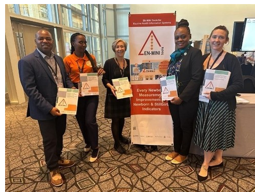
D4I and partners demonstrated the EN-MINI tools at the IMNHC Technical Marketplace.

From May 8-11, D4I attended the IMNHC conference in Cape Town, South Africa. D4I stood alongside 1,500+ maternal and child health innovators to help accelerate solutions to some of the most pressing global health challenges. Key D4I presentations included a demonstration of the EN-MINI tools at the Technical Marketplace and a panel featuring the EN-MINI tools as well as clinical vignettes based on D4I's experiences in the Democratic Republic of the Congo and Nigeria.